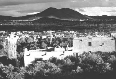
SANTA FE, NEW MEXICO

beside lows dating 19th Sunset reported rising price was forcing fifth-gener-Fe resi-